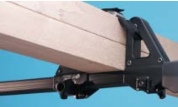
Load stops RTC9477