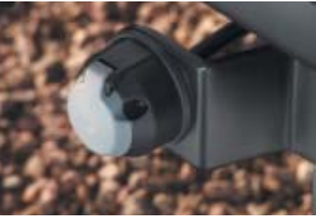
“S” type towing electrics “S” TYPE TOWING ELECTRICS KITS Three “S” type electrics kits are available. Two types provide caravan battery charging and interior equipment power. The split charge system protects the vehicle battery from accidental drainage. “S” type socket with split charge system, pre 99MY STC50179 The kit without the split charge should only be used with caravans built after 1999 when the split charge function was incorporated into the caravan systems. “S” type socket kit for 99MY caravans onwards STC50389 The third kit does not provide fridge feed or battery charging. “S” type socket kit (no fridge feed or battery charging) STC50180