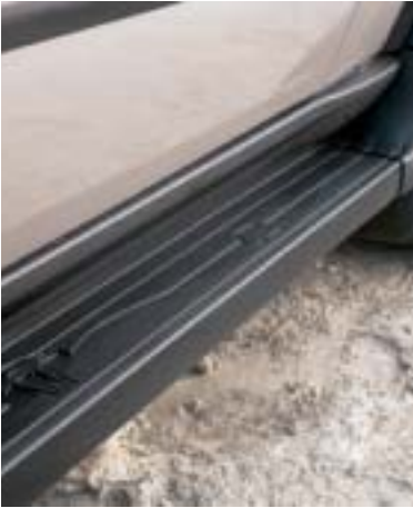
Side runners, pair, “Oasis” design STC50031