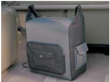
Electric cool bag VUP100140L