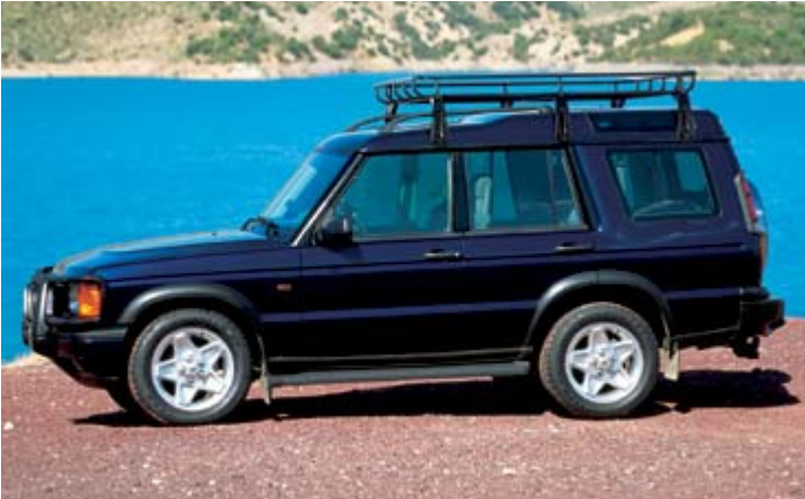
Expedition roof rack STC8830AA