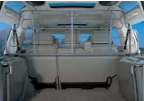
Dog guard STC50082AA