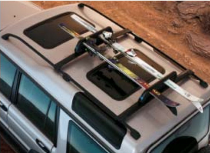
Ski carrier STC50184