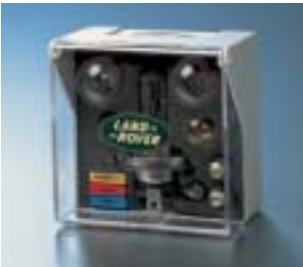
Bulb kit STC8274AA