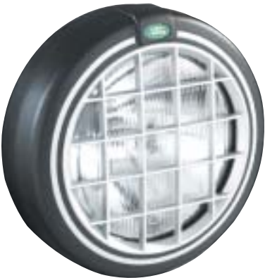
Safari 5000 driving lamp, single STC8480