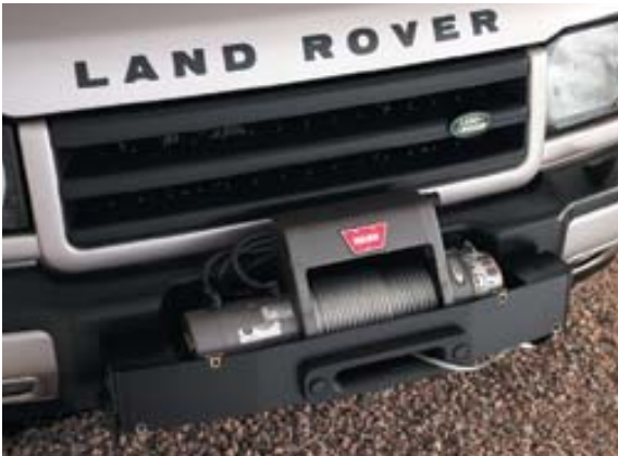
Warn Winch XD9000i STC50044