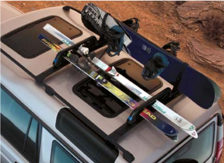
Ski and snowboard carrier STC50177