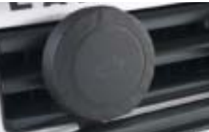
Moulded lamp cover STC50097