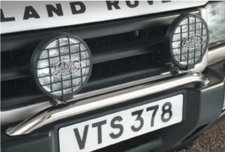
Rally 1000 driving lamp, single STC7644. Shown with mounting bar STC50244