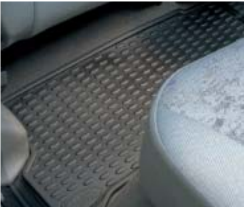
Rubber mats, footwell set STC50048 (rear)