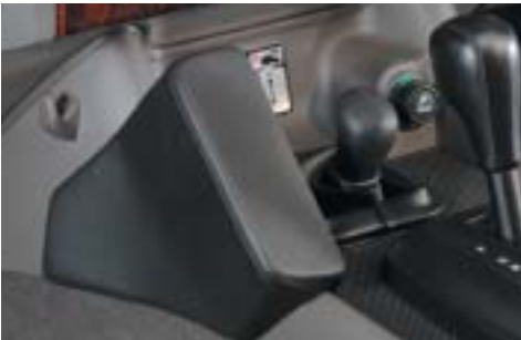
Mobile telephone bracket holder

A panel which attaches to the side cheek of the centre console, creating a space for a mobile telephone. Does not include telephone or telephone cradle.