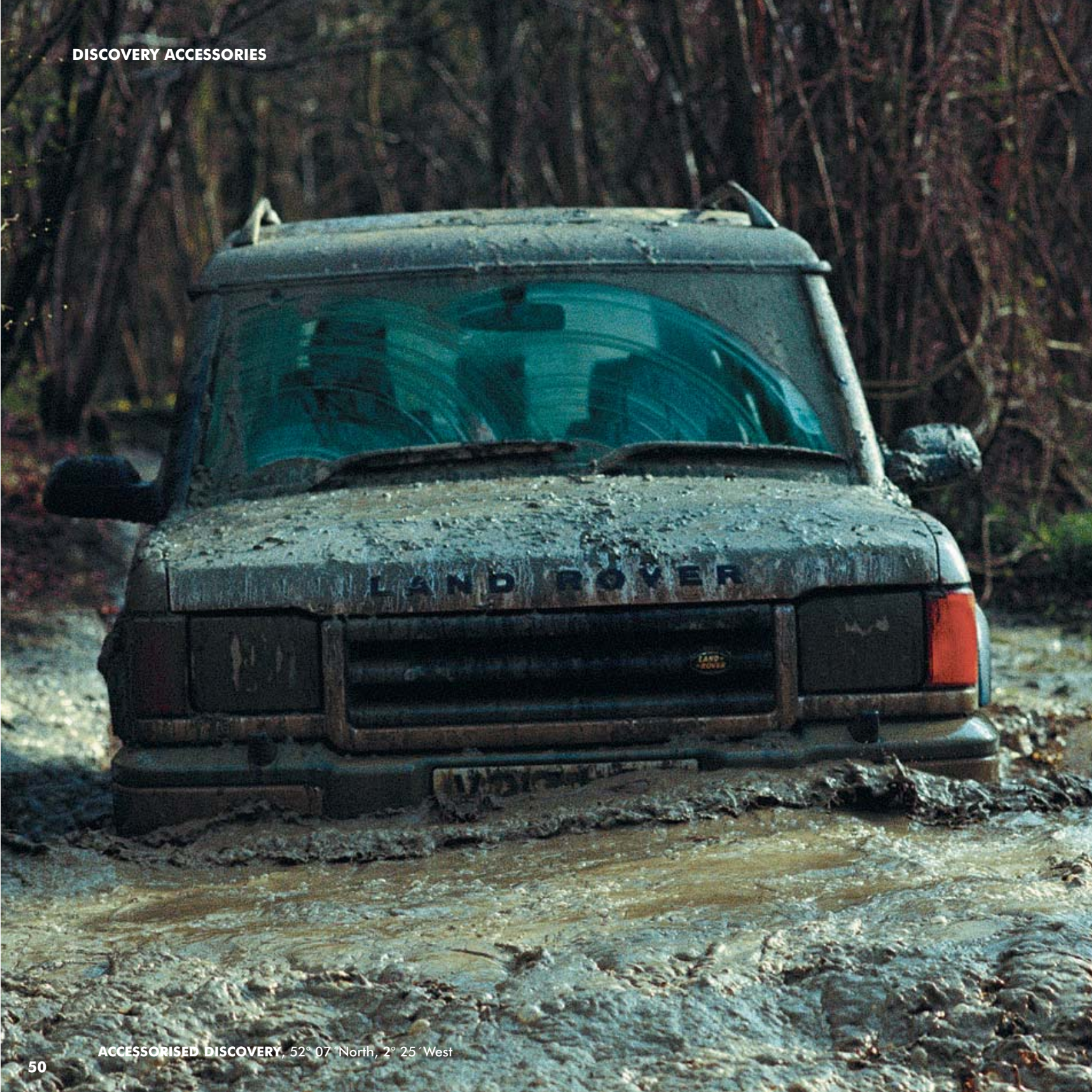
ACCESSORISED DISCOVERY. 52° 07' North, 2° 25' West