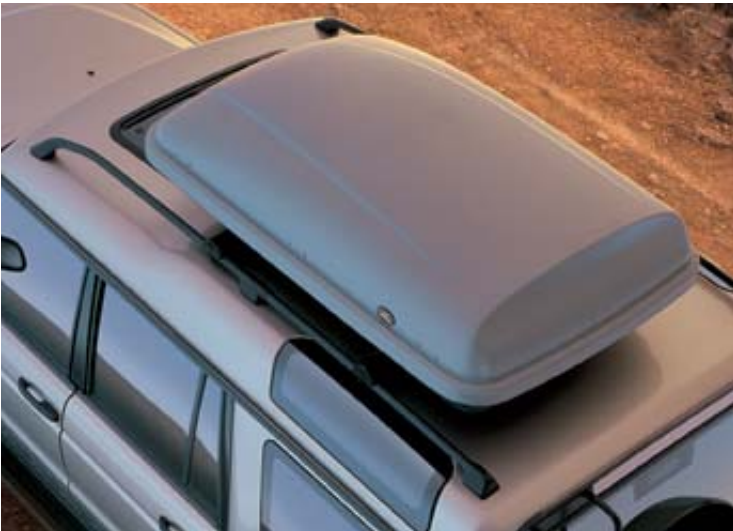
Luggage box CAK000020