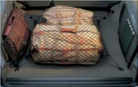
Side luggage nets, pair STC50133

When you're travelling with a lot of shopping or want to store things neatly and safely these strong and durable luggage nets are ideal. Made from washable woven nylon they fit neatly into the loadspace sides. Available for 5 seat vehicles only