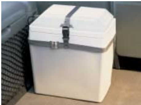
Electric cool/heater box STC7809AB