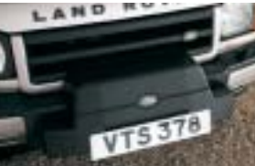
Winch cover ABS black moulded plastic STC50045