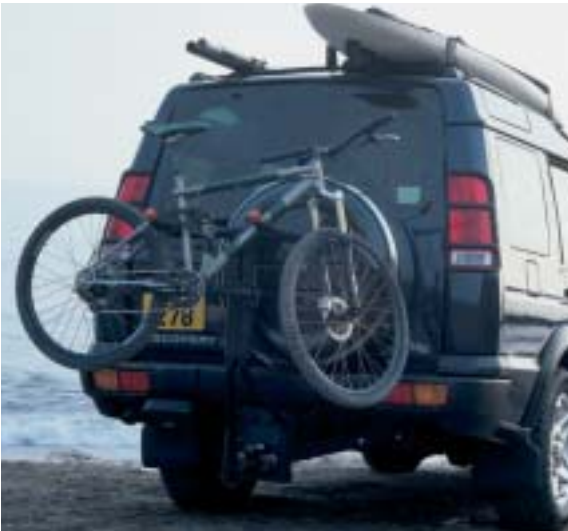
Tow bar mounted bike carrier STC50063