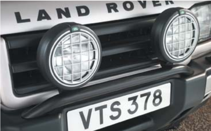
Safari 5000 driving lamp, single STC8480. Shown with mounting bar STC50243