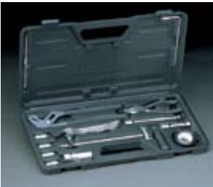
Tool kit STC8244AB