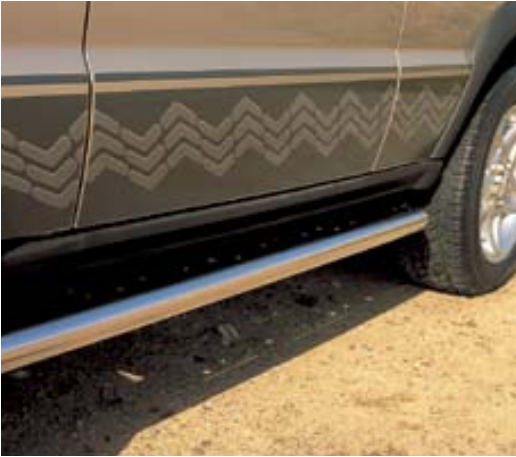
Graphic Protectors, “Chevron” STC500498