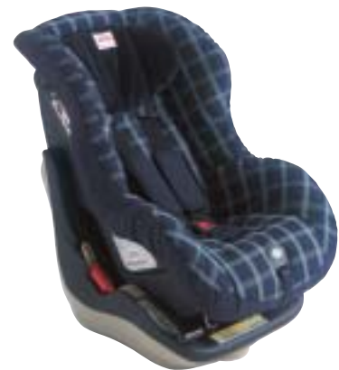
Renaissance baby seat EVY000100