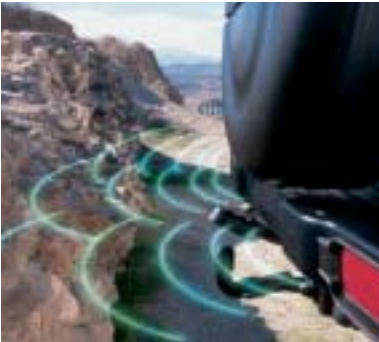
Discovery reversing with the aid of park distance control system STC50424AA , showing the location of sensors in the rear bumper