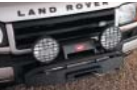
Winch with lamp mounting bar STC50243 and Rally 1000 driving lamps STC7644