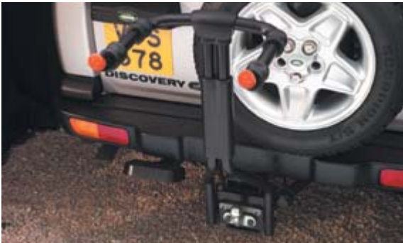
Bike carrier shown with padding to prevent damage to bikes