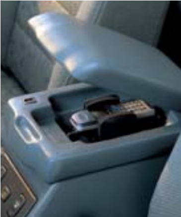
Cubby box lid, Dark Smokestone STC8934LPW

Hide your carphone from prying eyes with this integrated twin-lid design which replaces the cubby box lid. The first lid opens to reveal a recess for a phone, the second lid gives access to the cubby box. The phone lid is colour keyed for Beige or Dark Smokestone trim colours.