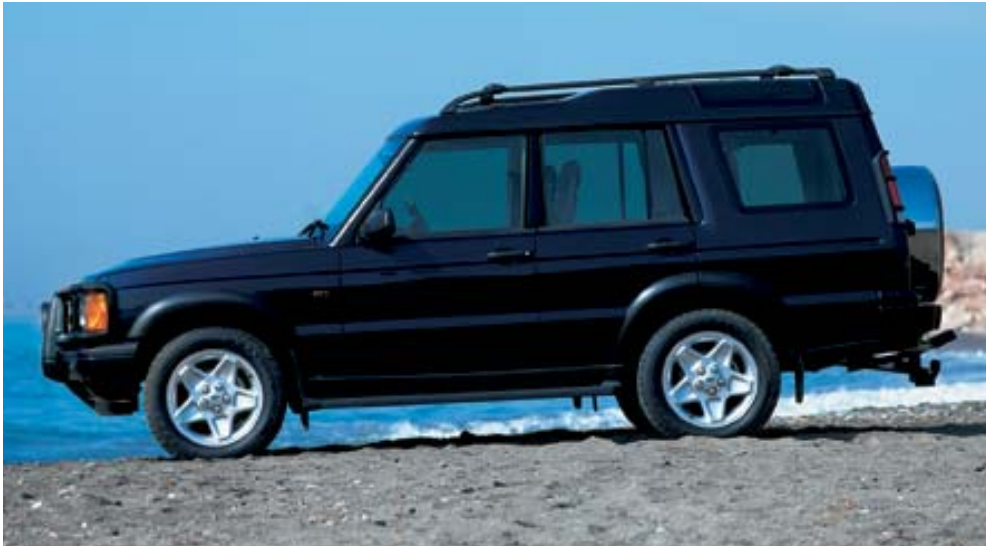
Extended roof rails STC50034

One touch secures the crossbar to the roof rail and a half turn of the key locks it to the rail. The cross bars can be positioned at any point on the roof rail for added flexibility.