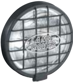
Rally1000 driving lamp, single STC7644