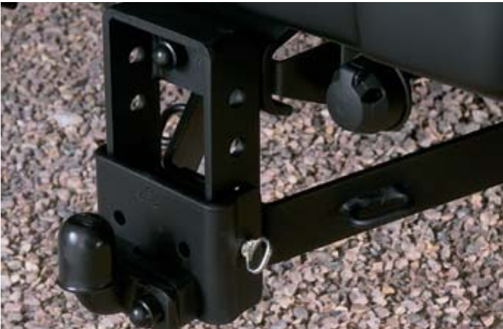
Adjustable tow bar ADJUSTABLE TOW BAR The adjustable tow bar copes with different trailer coupling heights without the need for any tools. The tow bar can be fitted with either a 50mm tow ball or a ball and jaw assembly. A Shocklink coupling, which reduces trailer pitching and trailer chassis loads can be specified with this tow bar. Adjustable tow bar, coil sprung vehicles (not shown) STC50287AA Adjustable tow bar, vehicles with self-levelling rear suspension STC50289AA 50mm tow ball (not shown) RTC8891AA Combination ball & jaw unit RTC8159 “N” type towing electrics kit (not shown) STC50081 Shocklink coupling (not shown) STC7669