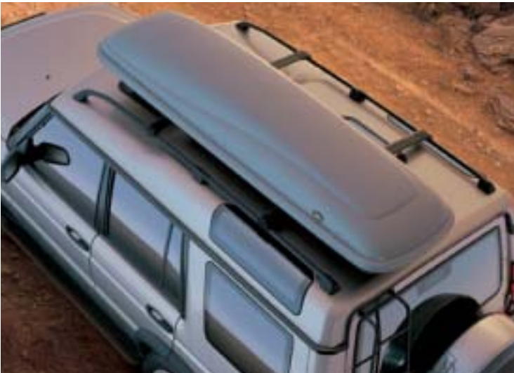
Sports box CAK000030