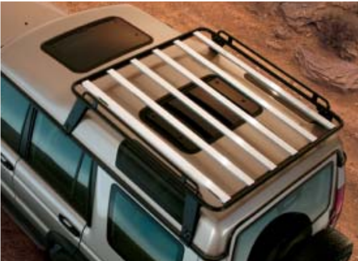
Roof rack RTC9539AC