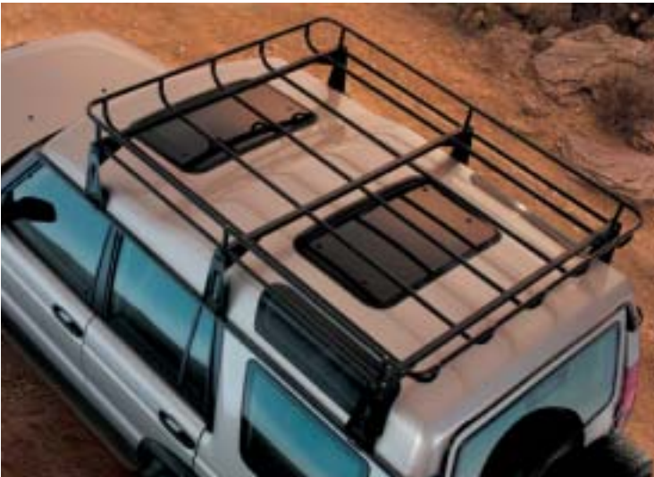
Expedition roof rack STC8830AA