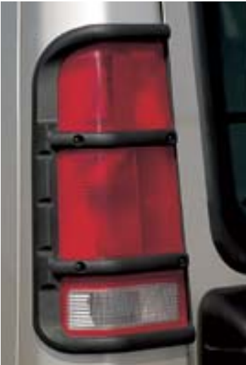
Lamp guards, removable, rear set of four STC50027