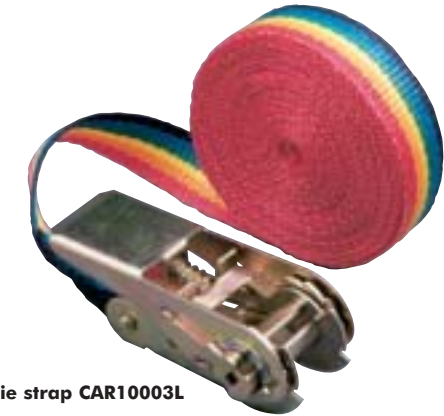
Tie strap CAR10003L

Adjustable mast holder for aerofoil cross bars.