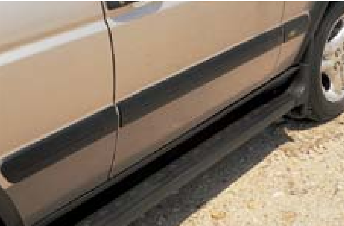
Body side mouldings STC50061