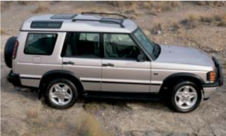
Side runners, pair, shown with Mondial alloy wheels STC50236