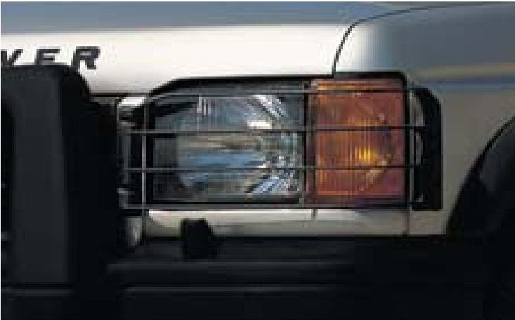
Lamp guards, removable, front pair STC50026