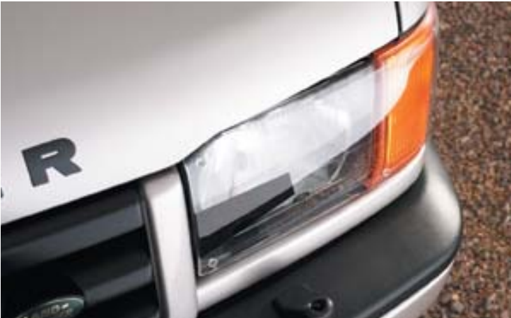
Headlamp protectors, pair STC50064 shown with continental converters STC50065