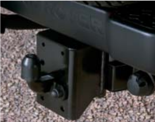
Two-position tow bar ANR6643 and extension box, with 50mm tow ball STC50038