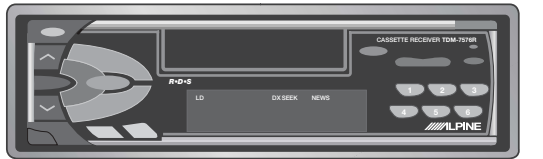
Alpine TDM7576R, mid-line CD Autochanger XQD000160LNF STC50432