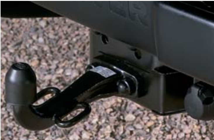
Two-position tow bar ANR6643 TWO POSITION TOW BAR Featuring a swan neck design with two height positions and includes “N” type electrics, a tube of grease and protective gloves. An extension box is available to give a greater range of towing heights and allows use of the STC50063 bike carrier or combination tow ball and jaw. The detachable conversion kit allows instant removal of the tow ball when not in use. A special version of this tow bar includes the detachable tow ball and European type 13 pin electrics. Two-position tow bar, suitable for coil sprung vehicles ANR6643 Extension box, with 50mm tow ball STC50038 Detachable tow ball conversion kit STC50036 Two-position tow bar, with detachable tow ball and 13 pin electrics system (not shown). Not available in the UK STC50035