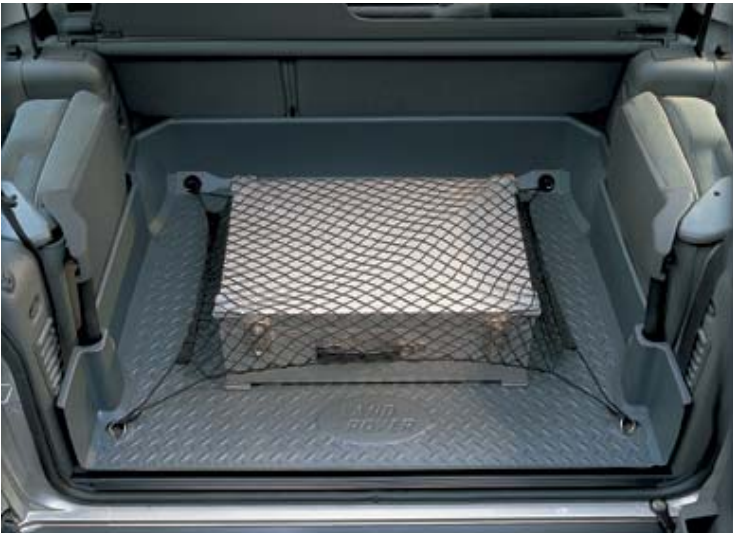
Loadspace liner, half length STC50050 & STC50073

Manufactured from a tough, shatterproof ABS plastic, and with cut-outs to allow loadspace lashing to be used, the loadspace liner protects the floor and sides of the loadspace and can be hosed down in a matter of seconds. Available in full length (rear seats down) or half length (loadspace area only), the liner includes an anti slip mat.