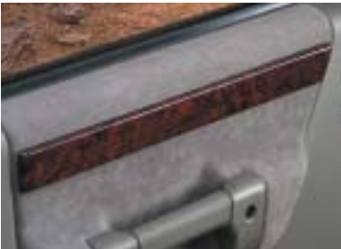
Wooden front door capping STC50317

These wooden door cappings will further enhance the interior of your Discovery. (Only available for front doors).