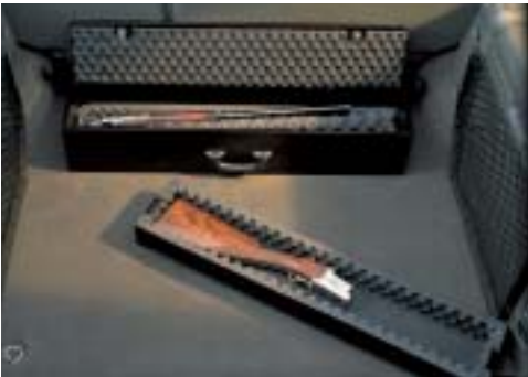
Gun/security box STC8018AB

For complete security and protection, this heavy gauge steel gun box is fitted with two high security locks and located in the loadspace by a strong metal plate. With enough room for two shotguns or valuables (internal dimensions 870mm x 190mm), contents are protected by generous foam padding. A padded, leather covered handle gives convenient portability.