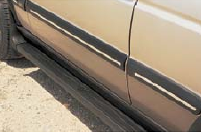
Body side mouldings, with bright insert STC50168

Protect the sides of your Discovery with this sturdy steel protection runner mounted directly to the vehicle chassis. In premium quality polished steel the side protection runner is stylish and safe, and features integrated mudflaps.