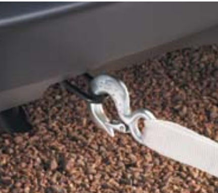
Tow strap STC8919 TOW STRAP This tough resistant strap in a flat webbing style can pull a safe working load of 3000Kg (6600lb). The storage bag can be folded around the strap for off-road towing and doubles as a warning ‘flag’. Tow strap STC8919