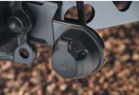
“N” type towing electrics kit STC50081 “N” TYPE TOWING ELECTRICS KITS The “N” type towing electric kits power trailer or tail board lights. “N” type electric kits only supplied with two position tow bar. “N” type kit STC50081 13 pin kit STC50178