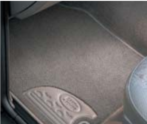
Carpet mats, footwell set, Slate Grey STC50046 (front)

These luxury quality carpet mats provide positive retention for front carpets and are colour matched to the vehicle carpet. The design incorporates the distinctive Land Rover logo.