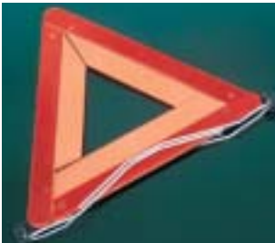
Warning triangle STC7641