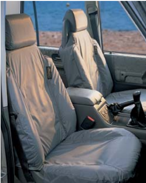
Front pair, manual seats, Grey STC50055LPW

Protect Discovery's seat trim from wet, dirty clothes and general wear and tear with these waterproof seat covers. Headrest covers are included, and seams are taped for added protection. Rear seat armrest, cup holder and map pockets on the rear of front seats can still be used. The seat covers have been treated to meet automotive flammability standards, and are machine-washable on a cool wash setting. When not in use, the seat covers can be stored away in their own carry bag. Please note that picnic trays cannot be used when waterproof seat covers are fitted.