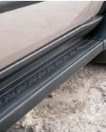
Side runners, pair, “Chevron” design STC50030