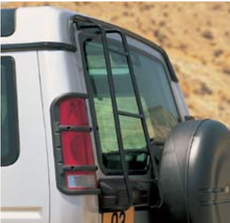
Access ladder STC50134