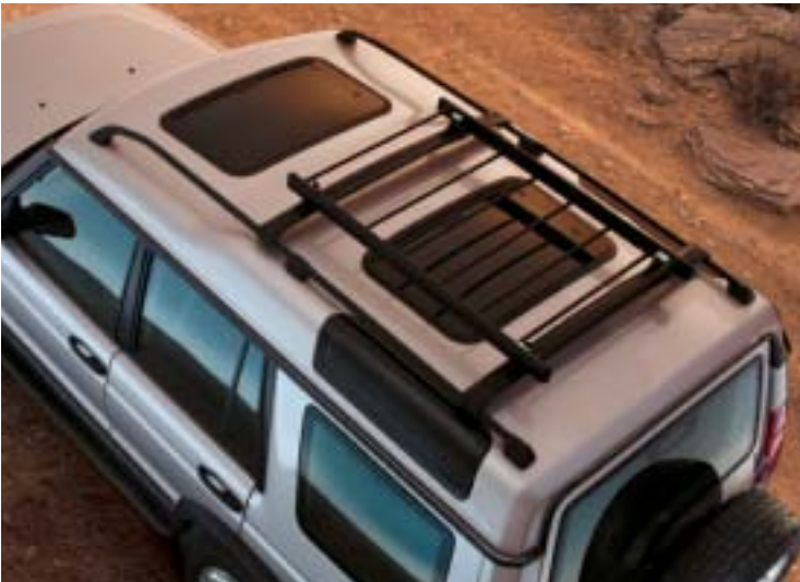
Luggage carrier STC50176AA