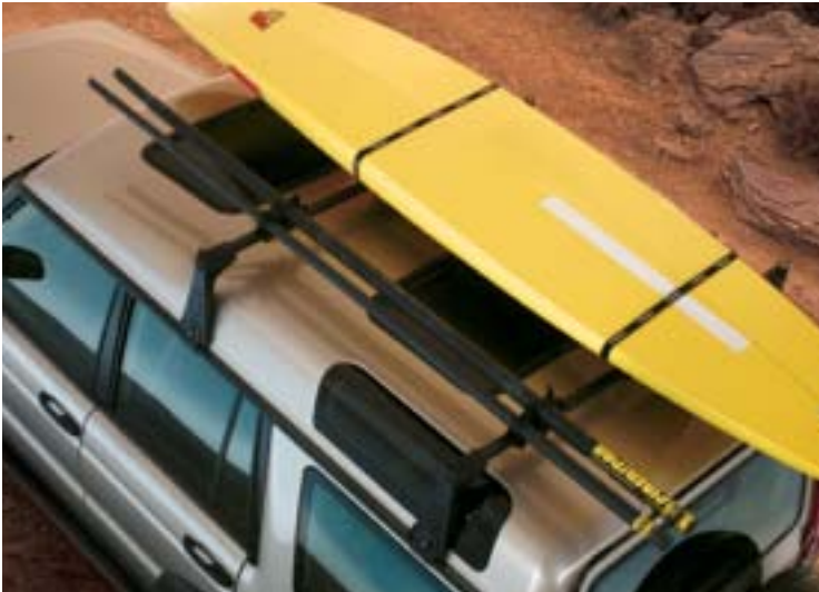
Sailboard carrier for sports bars STC8435