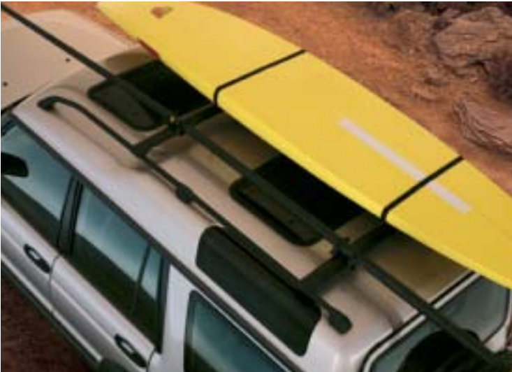
Sailboard carrier for roof rails with crossbars STC8527