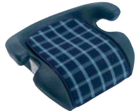
Booster seat STC7977