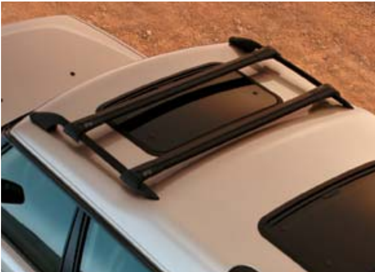
Mini roof rails and bars STC50274