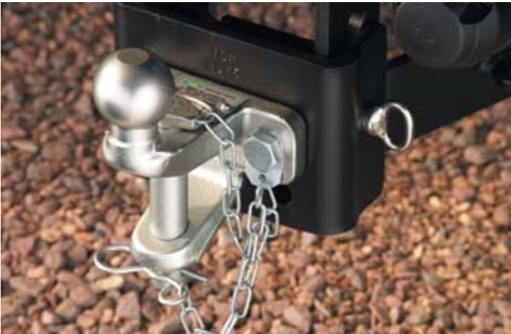
Combination ball/jaw tow unit RTC8159 COMBINATION BALL/JAW TOW UNIT 50mm tow ball and jaw combination, for increased versatility, 3.5 tonne capacity. Combination ball/jaw tow unit RTC8159