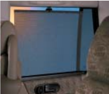
Sunblind kit STC50062

Keep the interior of Discovery cool and shady in the daytime, and ensure the privacy of your rear seat passengers with this fully retractable cassette design for the rear door windows. The ‘Magic Screen’ for fixed side widows gives maximum coverage.