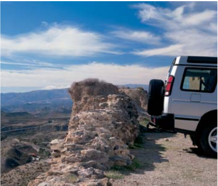
Discovery reversing with the aid of park distance control system STC50424AA