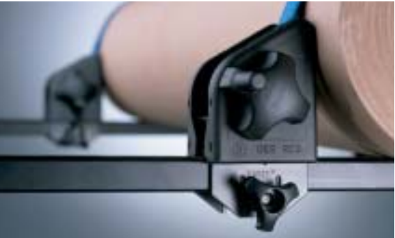
Quick straps STC7566