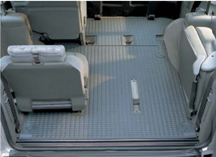
Loadspace mat, full length STC50053

Made from durable, flexible polyurethane material, the loadspace mat protects the loadspace floor from water, mud or general wear and tear. Available in full length (rear seats down) or half length (loadspace area only), the mat features cut-outs to allow use of loadspace lashing and rear seats.