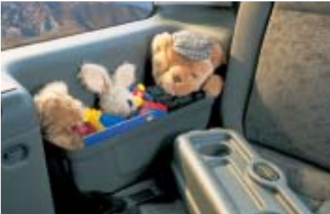
Toy bin, Dark Smokestone STC50070LPW

Ideal for long journeys, this attractive and roomy bin will keep everyone happy: children have all their books and toys to hand, while you can keep the vehicle loadspace tidy and free from clutter. The toy bin features drinks can recesses and oddments tray moulded into the lid, incorporates a shoulder strap to aid transportation, and fits neatly into the recesses of the loadspace sides when occasional seats are in operation.