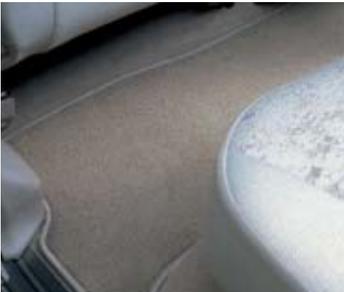
Carpet mats, footwell set, Slate Grey STC50046 (rear)