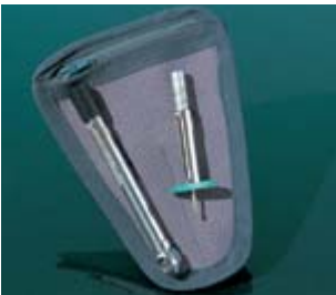
Tyre pressure and tread depth gauges STC724