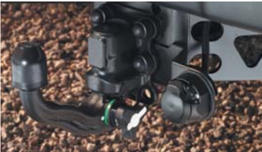
Detachable tow ball conversion kit STC50036 DETACHABLE TOW BALL CONVERSION KIT This lockable tow ball is easily removed when not required, avoiding the possibility of accidental contact when accessing rear luggage/passenger space, ideal for 7 seat Discoverys. Detachable tow ball conversion kit STC50036 Shown removed