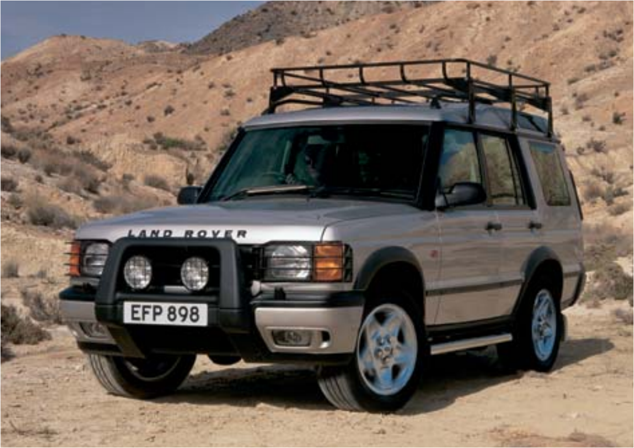
Protection bar, A-frame STC50021