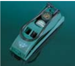
Foot pump STC8243