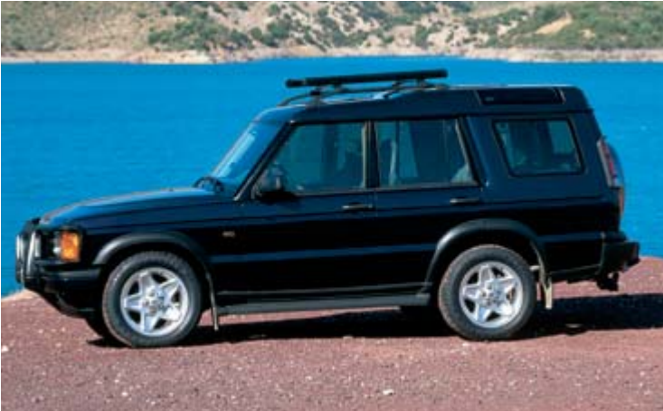
Luggage carrier STC50176AA

Not available in the UK Mini roof rails and bars STC50274