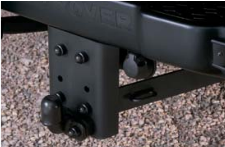
Multi-height tow bar STC50319 MULTI-HEIGHT TOW BAR A cost effective design which gives a range of towing heights to suit different trailers. The tow bar is supplied complete with a 50mm tow ball and is suitable for all Discovery models. Multi-height tow bar STC50319