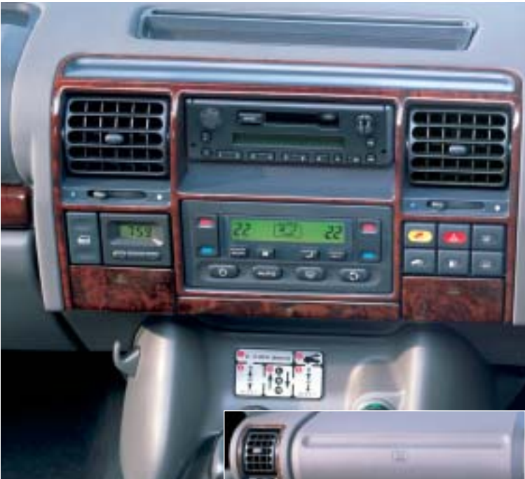
Wood enhancement pack STC50285

Manufactured from Burr walnut, the wood enhancement pack will add a feel of luxury to the interior of your Discovery. The pack includes a centre console panel, air vent surrounds and passenger side fascia trim panel.