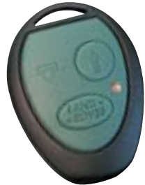
UK and European models STC50075 REMOTE CONTROL FOR REAR SUSPENSION PLIP This remote control Plip gives precise height adjustment of the rear suspension for vehicles with self-levelling suspension. Removes the need for winding jockey wheels when hitching trailers. UK and European models STC50075 Other markets except Japan (not shown) STC50143 Japanese models (not shown) STC50146