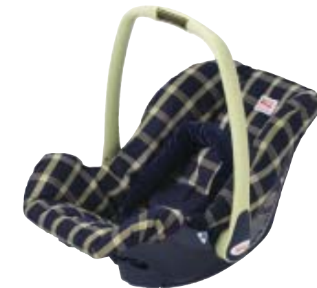
Rock-a-Tot baby seat STC7975