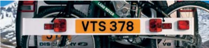
Lighting board STC8153