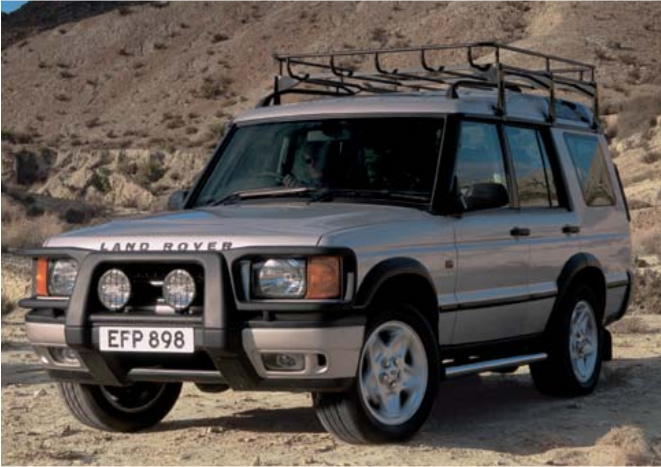
Protection bar, wraparound STC50020 PROTECTION BARS Soft polymer bars protect and enhance the front of your vehicle with a durable polyurethane outer surface. Available either in wraparound or A-frame style. Designed not to interfere with airbag deployment, the bars can be fitted with Rally 1000 lamps. Protection bar, wraparound STC50020 Protection bar, A-frame STC50021