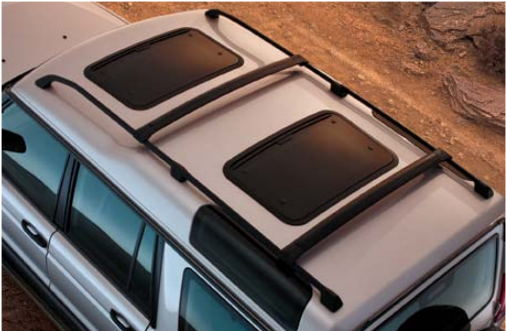
Lockable crossbars, pair STC50175 - Roof rail extensions, pair STC50034

Lockable crossbars, pair STC50175 Roof rail extensions, pair STC50034