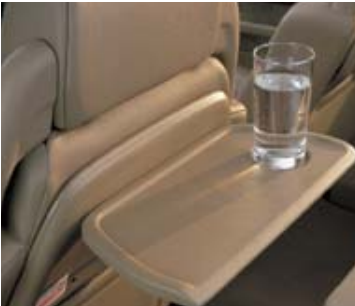
Picnic tables, pair, Bahama Beige STC50071SUC

Moulded in a stain resistant polyurethane, quickly and easily erected using gas-filled struts, this table fits onto the back of the front seats and provides a useful writing/eating surface for rear seat passengers.