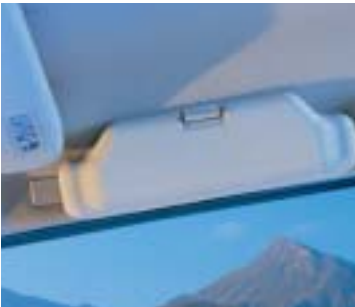
Sunglasses holder STC50086

This ingenious design fits neatly onto the headlining above the off-side door to house sun-glasses when not in use. The holder is colour matched to the headlining in ‘Mist Grey’.