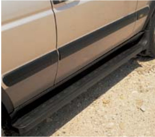
Graphic Protectors, “Shades” STC500497