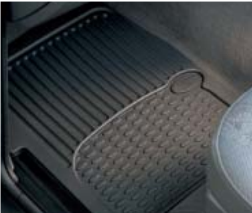
Rubber mats, footwell set STC50048 (front)

These robust and stylish mats, featuring the Land Rover logo, will help to protect vehicle carpets from water, wear and tear and the muddiest boots. A perimeter wall retains mud or water so there’s no danger of leakage.