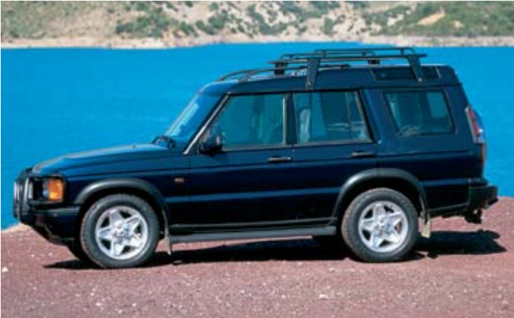
Roof rack RTC9539AC