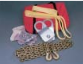
Winch accessory kit STC53202