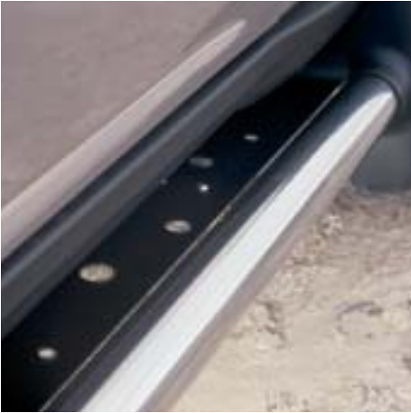
Side protection runners, pair, stainless steel STC50032