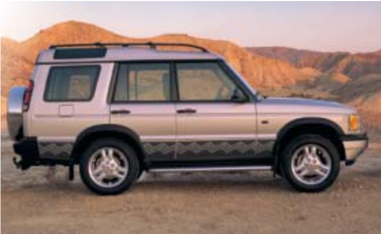
Graphic Protectors, “Chevron” STC500498, shown with Triple Sport alloy wheels STC50226