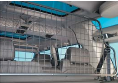
Mesh dog guard STC50323

To keep your dog safe, and to help keep the passenger space clean, the Dog Guard separates the loadspace area from the passenger compartment effectively and securely, but can be removed in seconds when not required. Available in Grey bar or mesh designs. Please note the Dog Guard should not be used when Occasional Seats are in use.