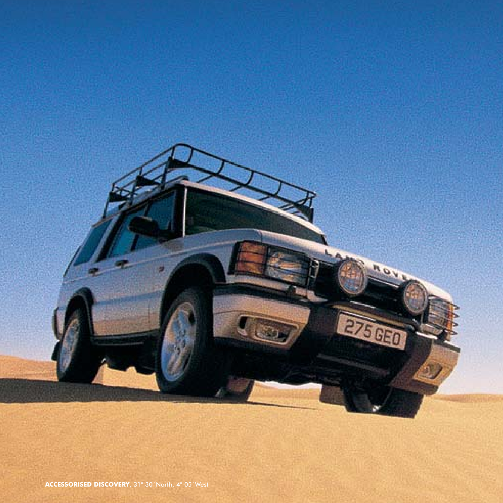
ACCESSORISED DISCOVERY, 31° 30' North, 4° 05 'West