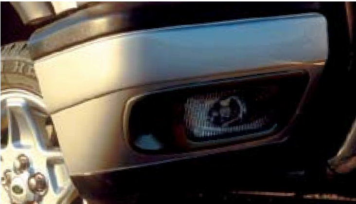
Fog lamps, spoiler mounted, pair STC50029