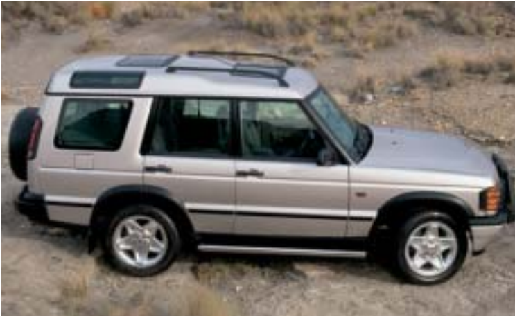
Side protection runners, pair, stainless steel STC50032, shown with Mondial alloy wheels STC50236